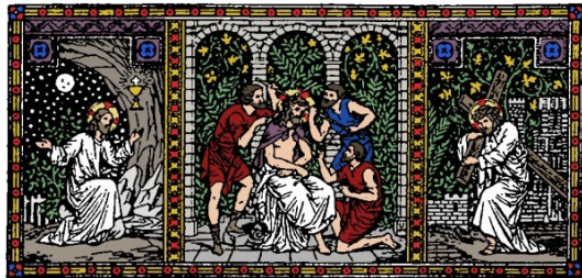
Answers to Holy Thursday Unscramble: before, Passover, disciples, you, afterward, never, hands, bread, last, come, out, world, BODY AND BLOOD.

Jesus was God and could have stopped the people from killing Him, but He chose to die for you. Because we sin, we don't deserve to go to Heaven. Jesus died to take the punishment for our sins so that we could go to Heaven. That's why it's called "Good" Friday! What is something special you can do on Good Friday to make up for your sins and say "thank you" to Jesus?